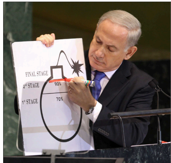
Netanyahu during one of his countless appearances, here at the UN General Assembly in June 2025.

Here is an excerpt from the official transcript of Tulsi Gabbard's (Director of National Intelligence – DNI) testimony before the Senate Select Com-