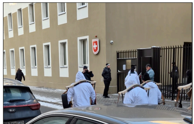
The “Freundschaftstrychler” arrive in front of the Swiss Embassy.