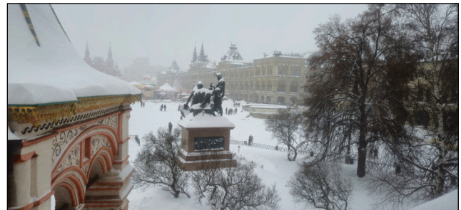
Snow-covered Red Square seen from St. Basil’s Cathedral.

the brightly lit Bolshoi Theatre, the Kremlin and streets and bridges decorated for Christmas. The next morning, the cowbells rang out for the first time in the hotel to welcome a group of Muscovites in their festive Russian costumes. They welcomed the Swiss tour group with a traditional Russian ceremony: they offered salt as a symbol of frugality and peace and invited them to break the bread that was also offered and sprinkle it with salt as a sign of lifelong friendship. The joint dance to the sounds of Russian folk music also had a unifying effect.